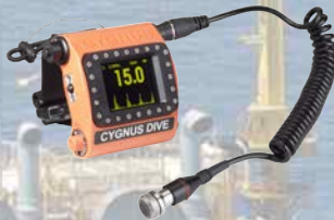
DIVE (Underwater A-Scan)