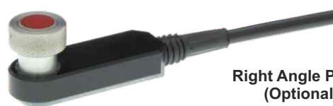
Right Angle Probe (Optional)

With multiple echo, readings are taken by measuring the time delay between any three consecutive backwall echos. The time of T1 (coating thickness) is ignored. The times of T2 and T3 are equal to the time that it takes to travel through the metal. Only by looking at three echos can the measurements be automatically verified (where T2 = T3).