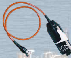
Mini ROV Mountable